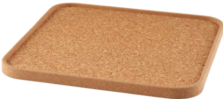
TRAY SQUARE TRAY