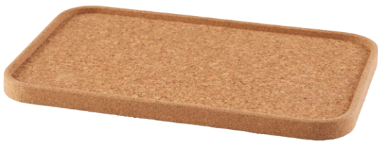
TRAY RECTANGULAR TRAY