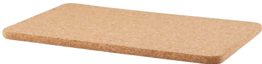
TRIVET RECTANGULAR TRIVET