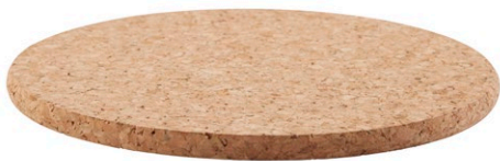
TRIVET ROUND TRIVET