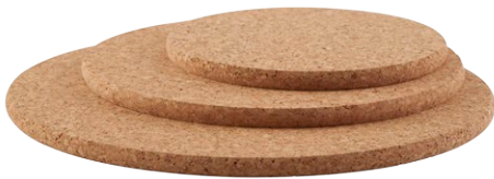
TRIVET SET OF 3 ROUND TRIVETS